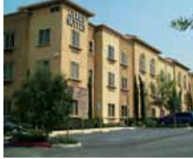
AYRES HOTEL, CORONA