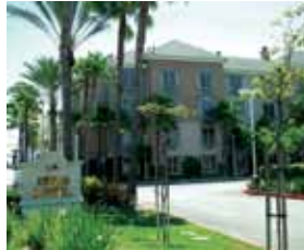
AYRES HOTEL, O.C.