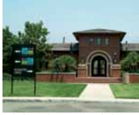
VICTORIA GARDENS REC. CENTER