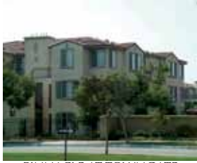
PINNACLE AT TOWNGATE