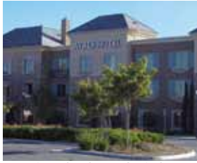
AYRES HOTEL, CHINO