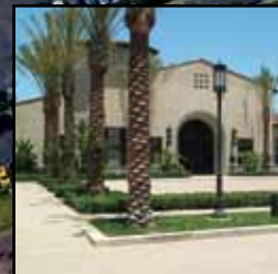
Enclave Recreation Center