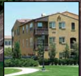
1 of 46 Buildings at the Enclave project